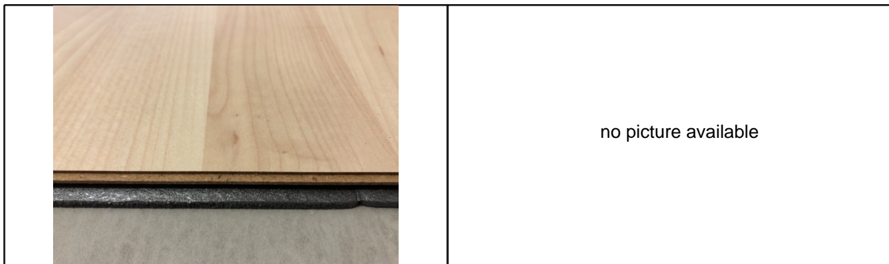
Illustration / drawing for sample assembly

Remark: Test performed in accordance to "TÜV Rheinland Nederland B.V. Test protocol Impact Sound" clause 1.1.